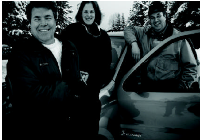
The staff of Jackson Lake Lodge proudly shows off their Hybrid vehicle. Grand Teton Lodge Company has reinvented itself so that the majority of their vehicles run on Hybrid energy or Bio-Diesel fuel.

Composting is a great way to reduce office food waste. For more information about how to compost and purchasing a composter contact Jackson Community Recycling at 733-SORT.