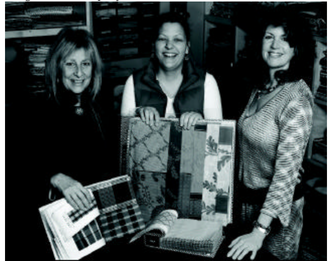
The Ladies at Gallinger Trauner Designs are proud RRR Business Leaders