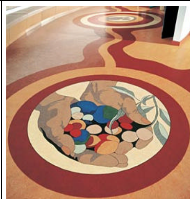
Marmoleum floor in action. Tiles can be used for any type of industrial use from art to factory floors.

One of the easiest things an organization can do to make a difference is to switch to 100% or high post-consumer percentage recycled paper. There is a common misconception that most paper is made of recycled materials, yet 90% of office paper is made from virgin trees. The average person in an office uses 12 pages of paper an hour!! Most paper suppliers have a recycled paper line, so ask your current supplier what is available. Always try to aim for the highest post-consumer content. Locally Staples offers a reasonably priced 100% and 30% line. You can buy it by the ream, box, or think bigger and save money by buying your paper by the pallet. Even if you have a small office, share a pallet with a neighboring office or buy a pallet to share with the entire of-