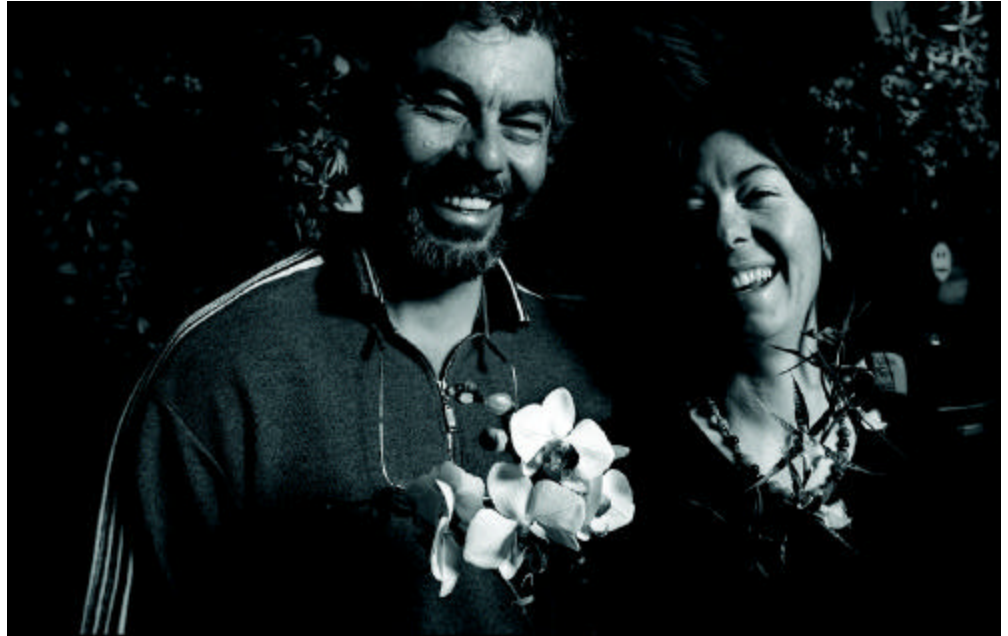
The owners of Fancy Plants reuse everything from packaging materials to price tags.

Relabel and send out used envelopes, especially golden envelopes because they are non-recyclable. To educate others many office supply stores sell simple stamps stating "this envelope is being reused to save natural resources."